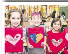
We sent Valentines to USA troops overseas.