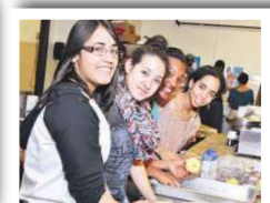
We cooked food for the hungry.

SPONSORED BY: NEFCU The Credit Union For All Long Islanders