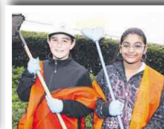
We cleaned up our neighborhood.